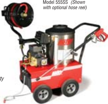
Model 555SS (Shown with optional hose reel)