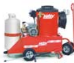
Model 771-Propane (Shown with optional Portage gear & Propane Tank)