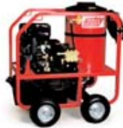
965B (Shown with optional pneumatic tires)