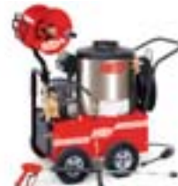
Model 560SS (Shown with optional hose reel)