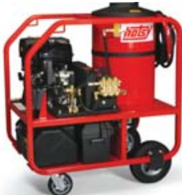
1075BE (Shown with optional caster wheel kit)