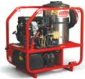
1080BE (Shown with optional stainless steel coil wrap and skid rails)

The belt-drive versions of the Gas Engine Series provide versatility with the roll cage design. Designed to fit the needs of the end-user, this versatile hot water washer converts easily to a skid unit, portable with wheels or a wheel/caster kit, or can be mounted on a trailer. Powered by reliable gasoline engines, the three models offer a broad range of cleaning power, from 3.0 to 4.6 GPM and from 3000 to 3500 PSI. All models feature the Hotsy Triplex pump backed by Hotsy's 7-year pump warranty and all are ETL safety certified. All models are equipped with a standard pressure switch and 50' hose.