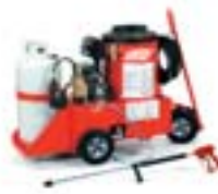
Model 558-Propane (Shown with optional Portage gear & Propane Tank)