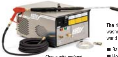
Shown with optional stainless steel cabinet