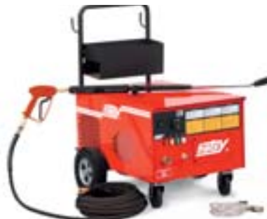
Model 1710 shown with optional wheel kit (PN 9.801-031.0).