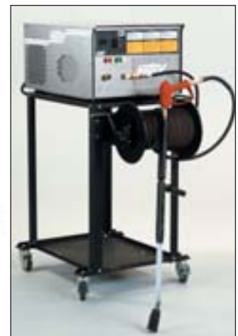
1700 Series shown with optional hose reel kit, (PN 8.903-039.0), cart (PN 8.903-034.0), caster wheel kit (PN 8.903-035.0) and stainless steel base and cover (PN 8.903-042.0).