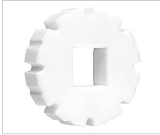
Sprockets Habasit Cleandrive™ series