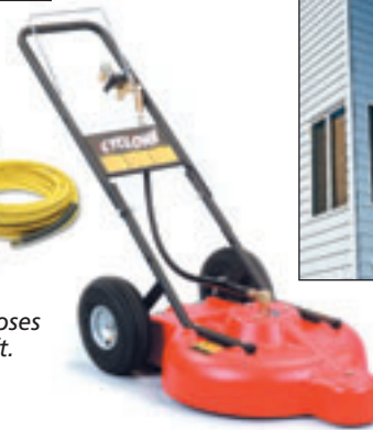
Rotary surface cleaner attaches to your pressure washer