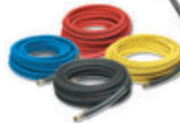
High-pressure hoses from 30 to 150-ft. lengths